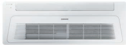
Slim 1 Way Cassette+