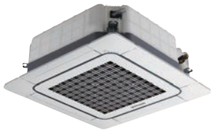
Mini 4 Way Cassette