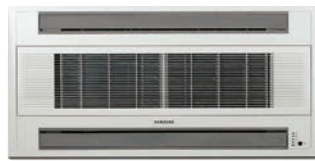
2 Way Cassette