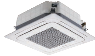
4 Way Cassette+