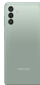
● Aqua Green

Image simulated for representational purpose only. *Measured diagonally, Galaxy M13 main screen size 16.72 cm with rounded corners and the camera hole. **Typical value tested under third party laboratory conditions. Actual Battery life may vary depending on network environment, usage patterns and other factors. The battery samples are tested under IEC 61960 standard. Rated minimum capacity is 5,830mAh. Colours as per the availability.