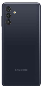
● Midnight Blue