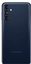
● Berry Blue