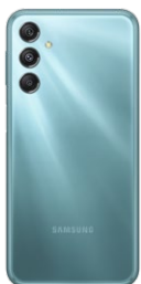
● Waterfall Blue