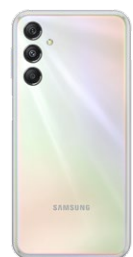
● Prism Silver

Image simulated. Colors subject to availability. *Measured diagonally, the screen size is 16.42cm in full rectangle and 15.98cm for the rounded corners. Actual viewable is less due to rounded corners and the camera cut-out. # Rated minimum capacity is 5830mAh. Actual Battery life may vary depending on network environment, usage patterns and other factors. Typical value tested under third party laboratory conditions. Typical value is the estimated average value considering the deviation in battery capacity among the battery samples tested under IEC 62133-2:2017 standard. Individual results may vary. ^ 5G network availability and actual speed may vary depending on country, network provider and user environment. Compatibility dependent upon 5G network availability.