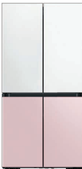
Glam White + Glam Pink