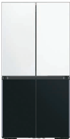
Glam White + Charcoal Black