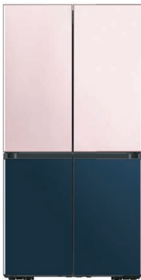
Glam Pink + Glam Navy