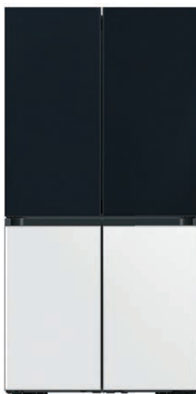
Charcoal Black + Glam White