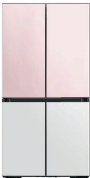
Glam Pink + Glam White