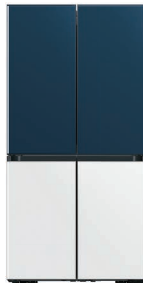
Glam Navy + Glam White