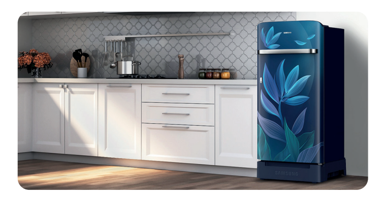
Elegant, softly curved round-top Horizontal Curve .