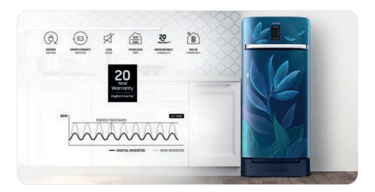
Comes with an eco-friendly Digital Inverter Compressor.