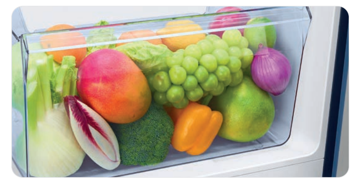
A large capacity Vegetable Box lets you conveniently store a lot of fruits and vegetables and access them easily.