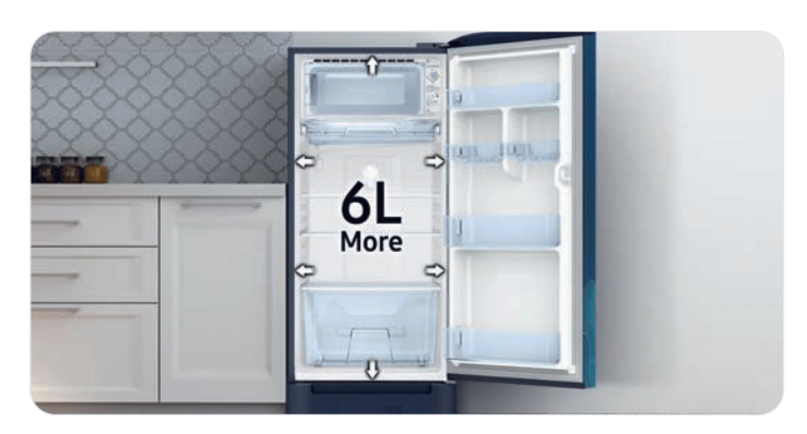
An extra 6L of internal storage in our single door range.