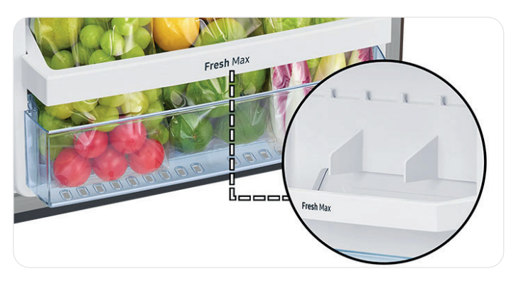
Fresh Max<sup>*</sup> is a multi-utility door bin with hooks with special divider and bottle guard.