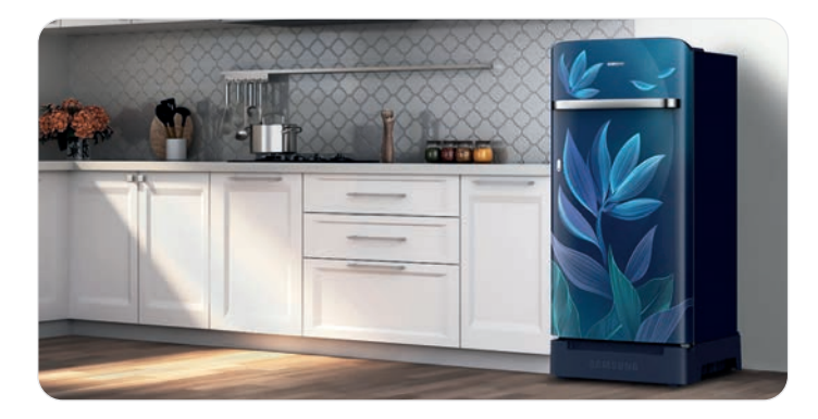
Elegant, softly curved round-top Horizontal Curve .