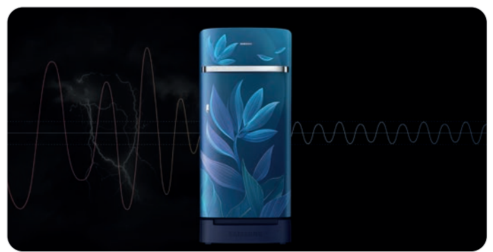
Low power consumption, runs on home inverter.